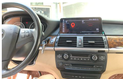
11. Effect photo after installation well.