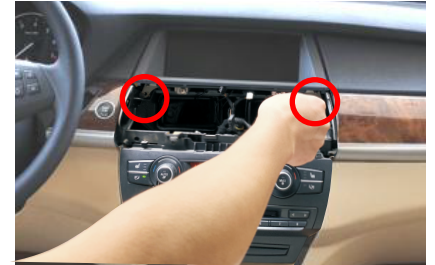
3. Remove the fixed screws from original monitor.