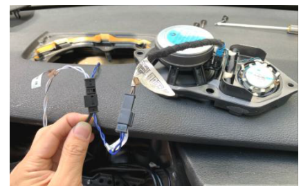
9. Connect well the center speaker cable with android cable.