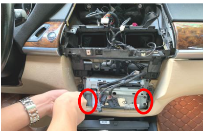
7. Remove the fixed screws from the Host.