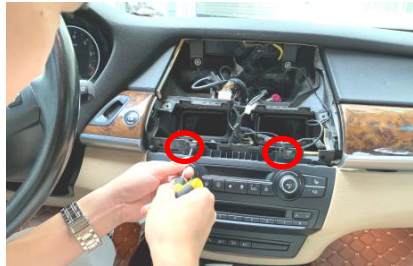
5. Remove the fixed screws.