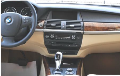
1. Original Monitor (Power off before installing).