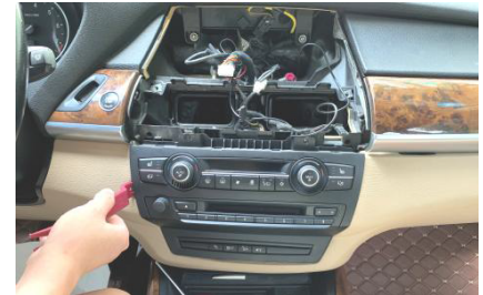
6. Pry it and take out the panel.