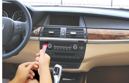
2. Pry loose and take out the decoration strip.