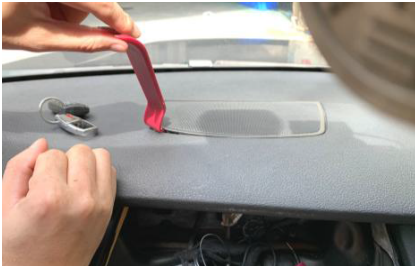
4. Pry loose the net and take out the center speaker.