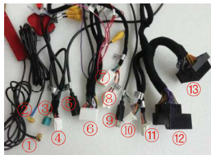
14. Android Cables connector