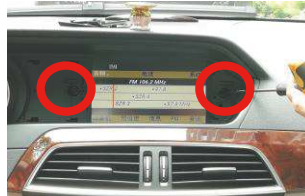
7. Remove the fixing screws of the original monitor