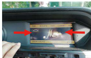
3. Take out the left and right decorative cover of the panel