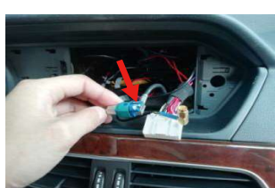
10. Connect original monitor LVDS cable with Android LVDS cable in RCA adapter