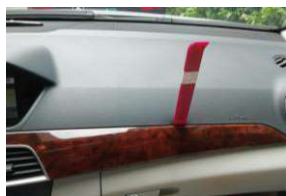
2. Pry out the air conditioning vent panel