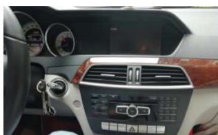
1. Original Monitor(Please power off before installation)