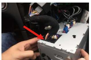
9. Remove the power harness from original host, and connect it to android harness.