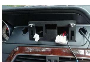
11. Assemble well the stand on original dashboard, and locked the screws, then put cables well.