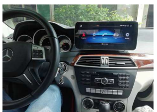
13. Effect picture after installation