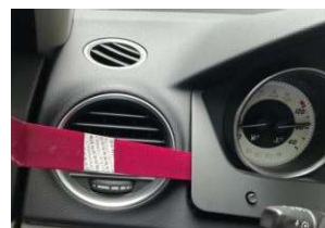
4. Pry the decorative strip shown in Figure