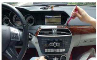
5. Pry the right decorative strip