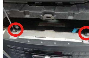
8. Loosen the fixing screws of the original HOST, and take it out.