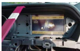
6. Pry the top decorative strip and take it out